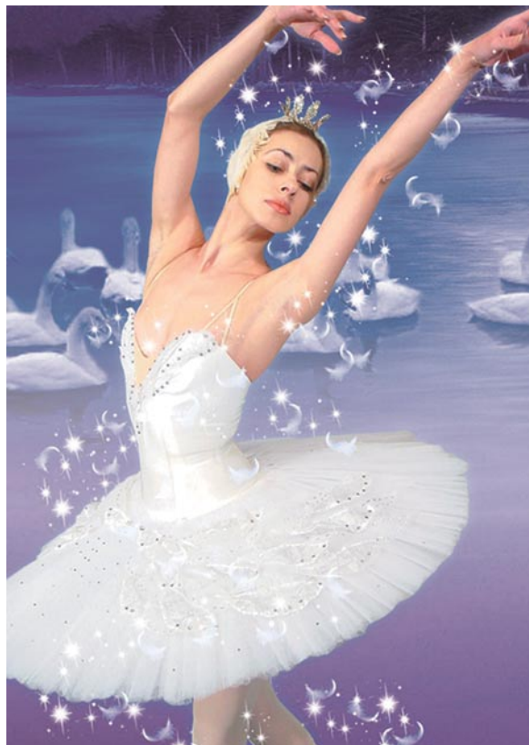
Swan Lake appearing at the Empire Theatre.