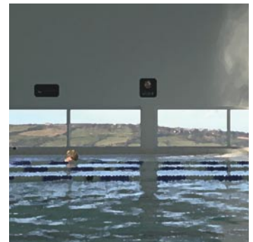
The Louisa Swimming Pool

We hope your stay in Derwentside won't be all work and that you will take advantage of a range of facilities and services on offer to delegates.